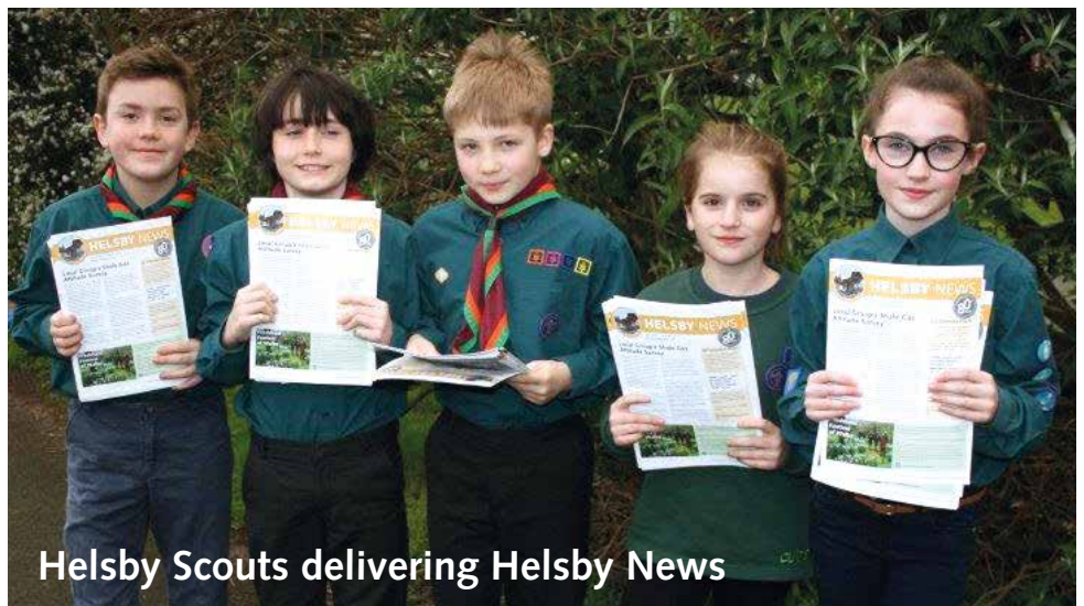
Helsby Scouts delivering Helsby News