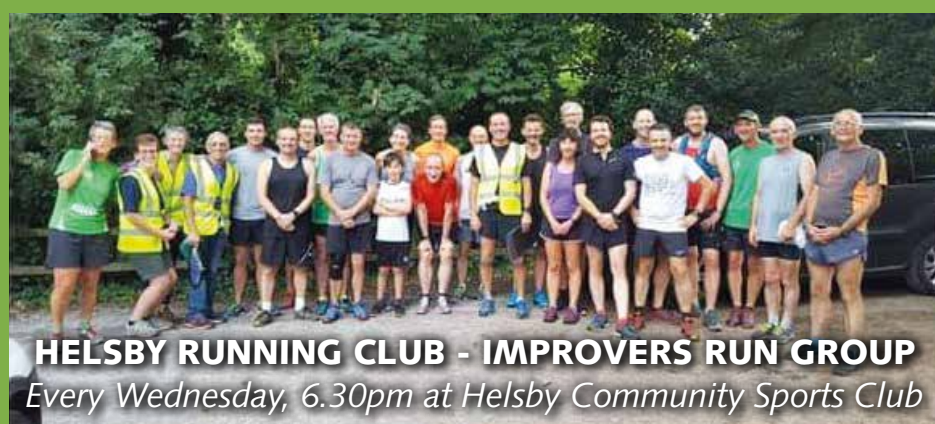
HELSEBY RUNNING CLUB - IMPROVERS RUN GROUP Every Wednesday, 6.30pm at Helsby Community Sports Club

Can you run for 30 minutes and want to improve or simply run with others? If so, this is the group for you! No matter how slow you are, you won't be left behind. All abilities are catered for.