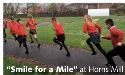
"Smile for a Mile" at Horns Mill

Children must be supervised at all times by a parent or guardian.