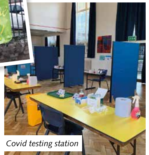
Covid testing station