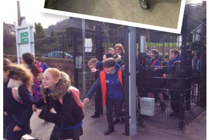
Hillside children can't wait to get back into school