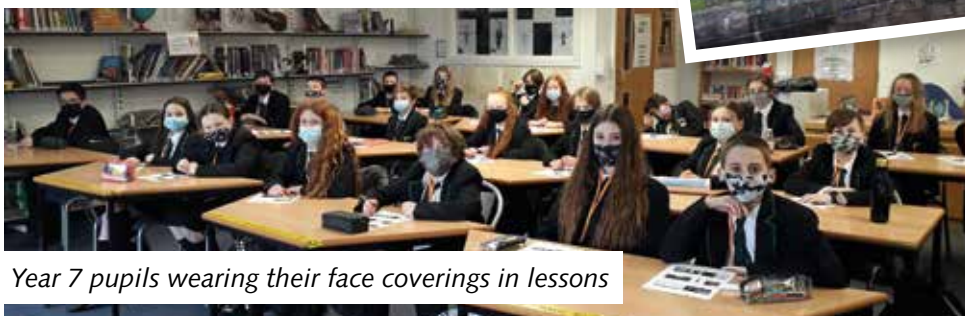
Year 7 pupils wearing their face coverings in lessons