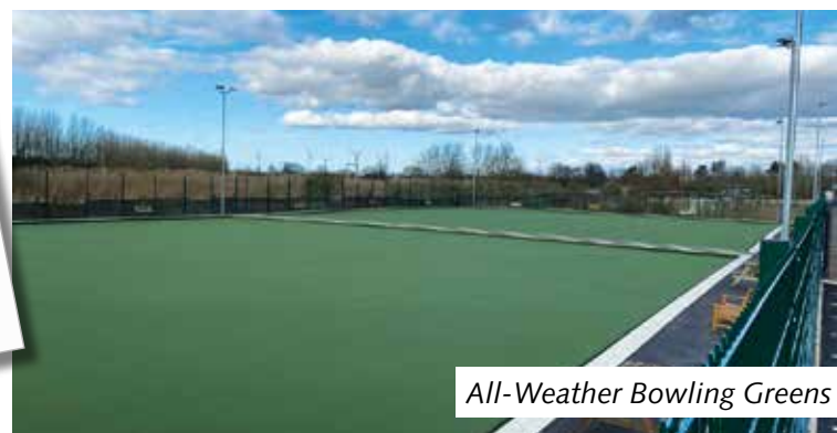
All-Weather Bowling Greens