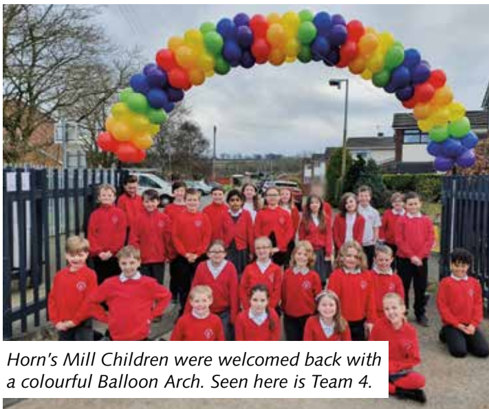
Horn's Mill Children were welcomed back with a colourful Balloon Arch. Seen here is Team 4.

The delight to be back at school is OH SO evident in these pictures.