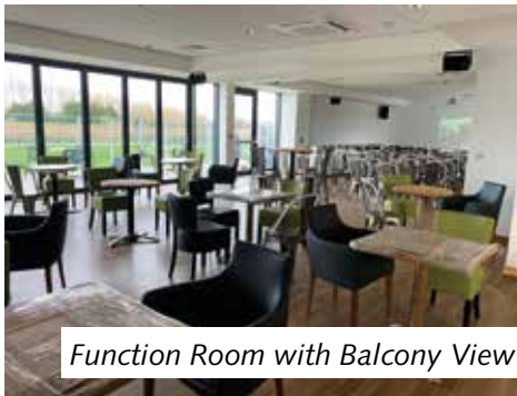
Function Room with Balcony View