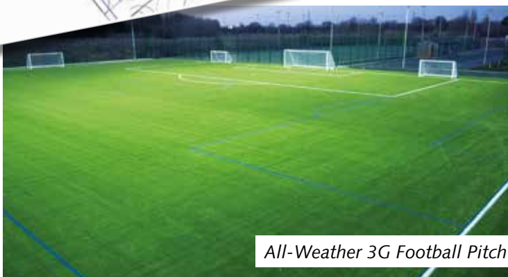
All-Weather 3G Football Pitch