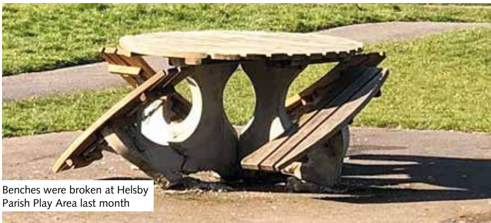
Benches were broken at Helsby Parish Play Area last month

taking responsibility for their kids, youths taking responsibility for their actions, and Cheshire West Council ensuring there are things for young people to do other than hang out on street corners."