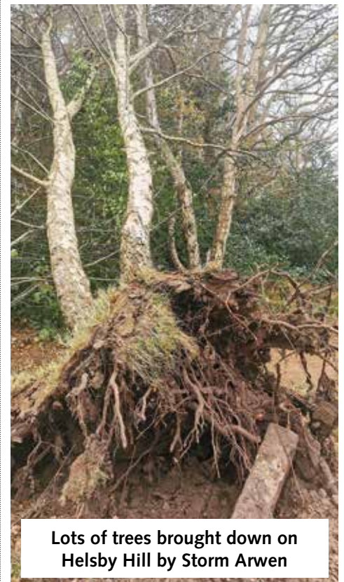
Lots of trees brought down on Helsby Hill by Storm Arwen