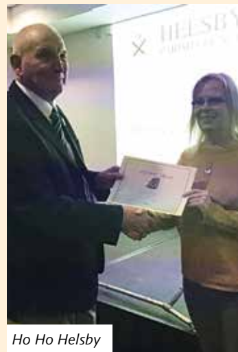
Ho Ho Helsby