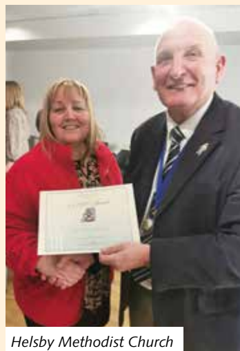
Helsby Methodist Church