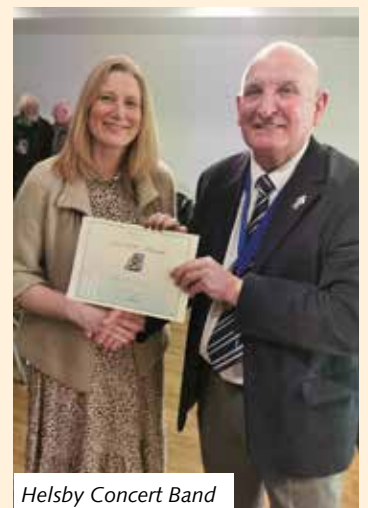
Helsby Concert Band