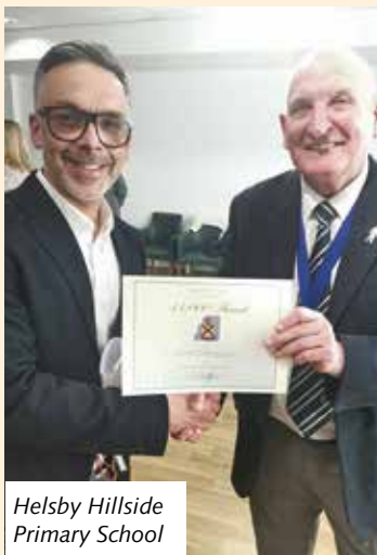
Helsby Hillside Primary School