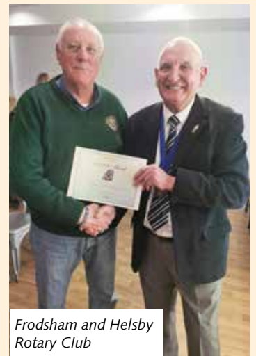
Frodsham and Helsby Rotary Club