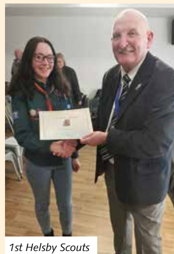
1st Helsby Scouts