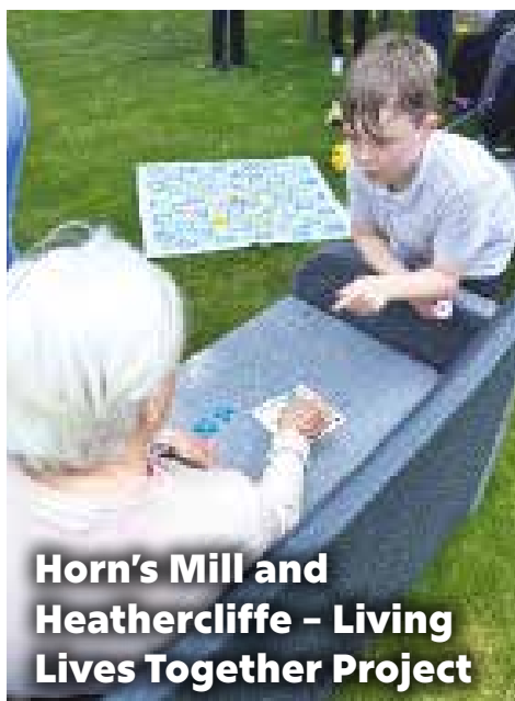
Horn's Mill and Heathercliffe – Living Lives Together Project

As headteacher at Horn's Mill, I have been delighted to be working with the charity Ready Generations over the last few months. Ready Generations work closely with Belong Care Village, Chester www.belong.org.uk/locations/chester to connect people of all ages providing opportunities for people to enjoy multi-generational experiences as part of daily life. Ready Generations https://readygenerations.co.uk/ is a research charity that is keen to expand research further into the positive impact of intergenerational work across all ages.